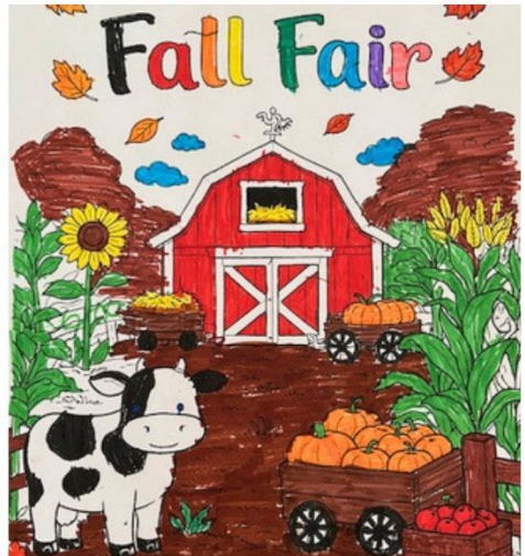
Fairbook Cover Competition – Honourable Mentions